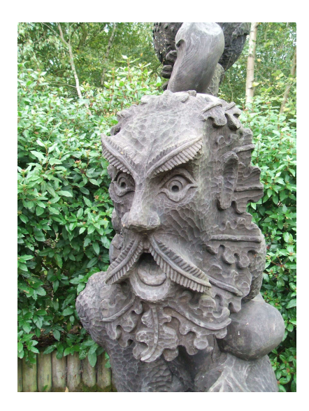
Example of sculpture in Shorne Country Park

An initial brief for the sculptures in the park is: